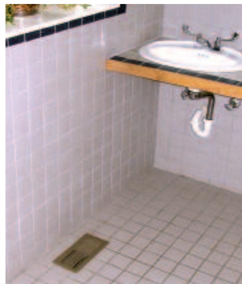
Bathroom floors and walls are tiled with Terra Traffic tiles, made from more than 55 percent recycled glass and select ceramic materials.

able in 22 designer colors (and custom options for projects more than 1,000 square feet) in a variety of sizes to create just about any floor and wall design imaginable. Terra Green offers a complete line of trim for floor and wall applications as well. Terra Traffic tiles have an excellent wear rating, and are stain and scratch resistant.