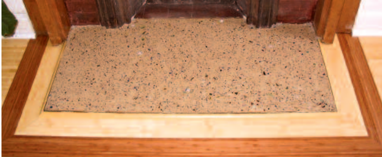
A hearth of recycled glass terrazzo from EnviroGLAS Products Inc. conserves natural resources by diverting glass from the landfill.

means minimal transportation impact and therefore minimal greenhouse gas emissions. Customizable to match any color swatch, the 100 percent post-consumer/industrial recycled glass surfaces are low maintenance, with a life cycle of more than 40 years. EnviroGLAS Terrazzo does not burn and resists staining and chemical and bacterial growth, requiring daily maintenance of only dry mop and weekly buffing. Maintenance of extremely high-use areas requires only neutral pH cleaners and