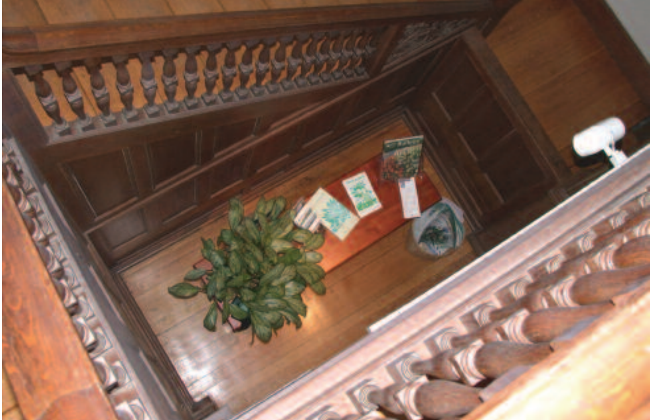
Hardwood floors were preserved and enhanced; the old wood was stripped using a non-hazardous citrus-based stripper.