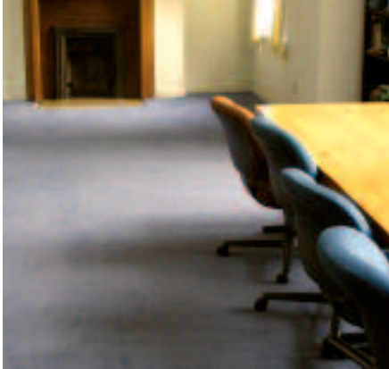
Carpet made from recycled plastic (PET) soda bottles was installed in the EarthWays Home.

The stairways and landing room sport a deep forest green Forbo (Hazleton, Pa.) Marmoleum application installed by Colonial Carpet Co. (St. Louis). Made of linseed