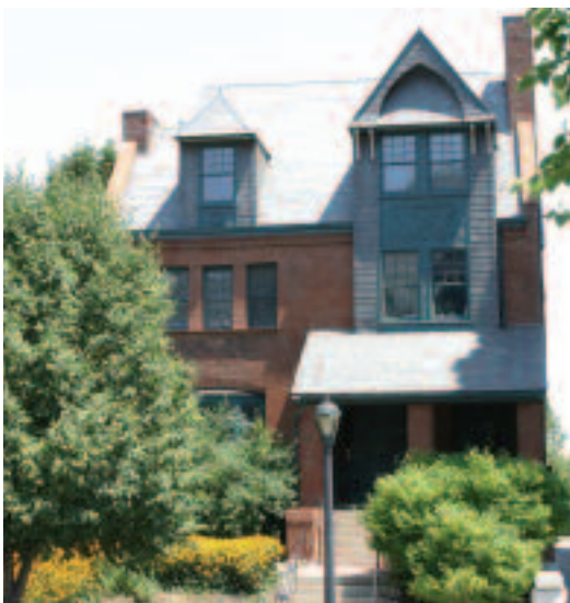
EarthWays Home in St. Louis showcases several types of sustainable floorcoverings.

From the outside, you might never guess that this Queen Anne-style Victorian townhouse built over a century ago is the home of seven diverse sustainable flooring systems. Located in St. Louis' Grand Center arts and entertainment district, the EarthWays Home is nestled among theaters, museums, updated homes and homes still in need of rehab. How was this structure transformed from a single-family dwelling into a showcase for green flooring (and more)?